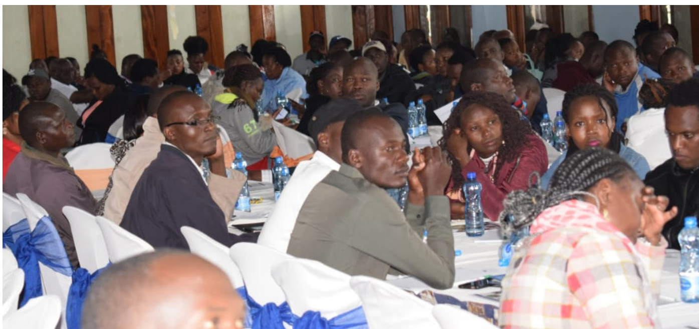
Members follow proceedings during the Kanisa SACCO Education Day event held at Cooperative Retreat and Conference Centre

The 2019 Education Day event of the Kanisa SACCO was held on Saturday, 7th September 2019 at the Cooperative Retreat and Conference Centre located within the Cooperative University of Kenya in Karen, Nairobi from 9:00 am to 4:00 pm. Convened under the theme “managing your wealth and securing your future through healthy living” the event attracted a total of 236 members plus at least 4 potential members.