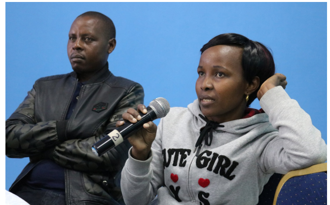
A new member of the SACCO making a point at the Chai Day event held on Saturday 22 June 2019 at DTCC in Westlands, Nairobi.

The SACCO offers its members different savings vehicles, loan products and services at affordable interest rates and with friendly terms and conditions. Visit www.kanisa-sacco.org to learn more about the SACCO and how you too can benefit.