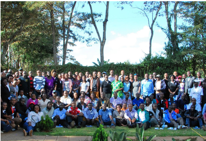
Kanisa SACCO members during the Education Day at Sportsview Hotel, Kasarani in 2015

In its 38th year now, the SACCO has grown to have a strong financial base and attracted membership from more than 20 other institutions, both faith-based and non-faith based; as well as many individual contributing members.