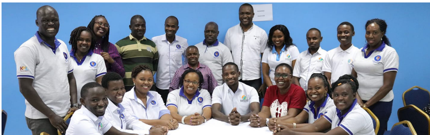
Members of the Central Management Committee, Supervisory Committee and Staff of Kanisa SACCO pose with the Staff of SureStep Systems and Solutions Limited after the launch of the new Enterprise Resource Planning System, Microsoft Dynamics 365 Central.

The 38th Annual General Meeting held at the AACC Desmond Tutu Conference Centre on 9th March 2019 elected new members to the Central Management Committee and Supervisory Committee. Following the subsequent resignation and co-option of new members, the SACCO's leadership for the year 2019 comprises of the following: