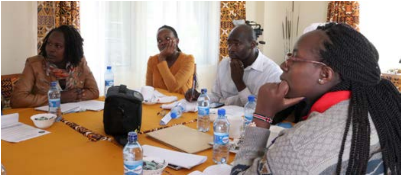
Members of Kanisa SACCO Management during a meeting to discuss the impacts of the COVID-19 Pandemic on SACCO operations

Following the Kenyan government directive on the containment of COVID-19 made on Friday, March 13, 2020, suspending all mass/public gatherings or meetings of any nature until advised otherwise, the management had to postpone until further notice the Kanisa SACCO AGM that was slated to take place on Saturday, 21st March 2020. This also followed a circular that we have received from the State Department of Cooperatives, Office of the Commissioner suspending all general meetings.